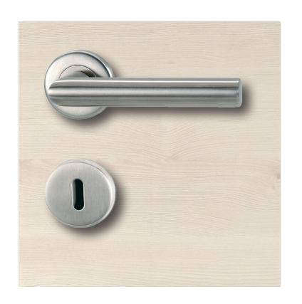
L297 L-shaped standard set Matt stainless steel