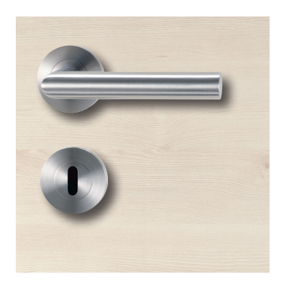
Lucia design set Professional matt stainless steel