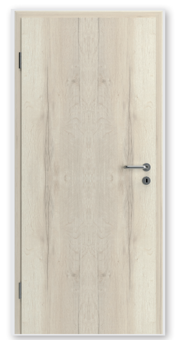
Lebolit PREMIUM Nordic Oak