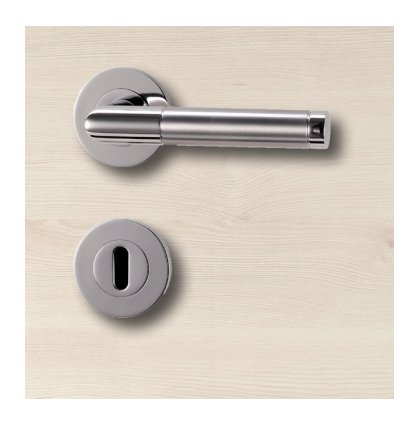
Loredana design set Professional matt stainless steel