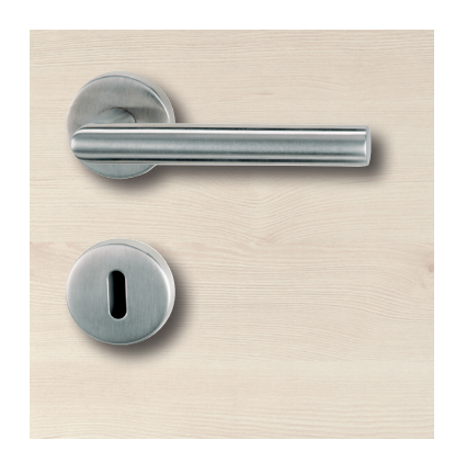
Lucia design set Matt stainless steel