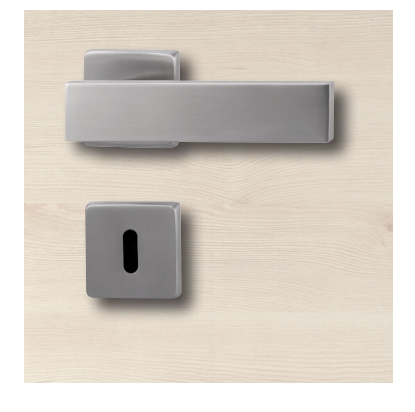
Carla Square design set Matt stainless steel