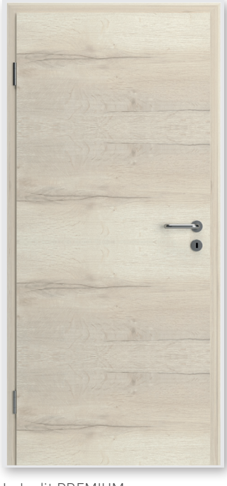
Lebolit PREMIUM Nordic Oak Cross

The Nordic Oak surface picks up the Scandinavian design trend: light-coloured, cool wood looks, which are excellent partners for other Nordic wood species such as spruce or pine, and harmonise with light-coloured and neutral colours such as grey, white or beige. An individual eyecatcher or targeted accents in dark grey, black or dark blue make the look even more interesting.