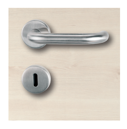
Alessia design set Matt stainless steel