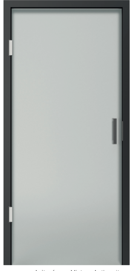
Aalto: frame Mixture Anthracite, glass satinated, hinges TEG 310 2D